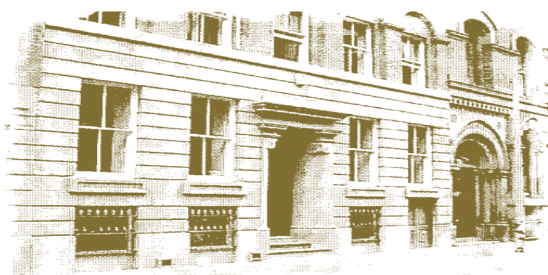
HENRY PILLING HOUSE BOOTH STREET, MANCHESTER M2 4AF

We pioneered Personal Equity Plans (PEPs) and their replacement Individual Savings Accounts (ISAs), and defined the development of this special market nationally. Our expertise in ISAs also covers "self-invested" Personal Pensions (SIPPs) of which many clients have already taken full advantage. In recent years we have added Child Trust Funds (CTFs) to the menu and more recently JISAs giving you the investment vehicles you need to look after all the family. However, we do not just give you sound information to enable you to choose your own investments, all administered by us, we also specialise in Investment Management and Discretionary Management services.