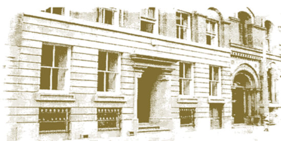
HENRY PILLING HOUSE BOOTH STREET, MANCHESTER M2 4AF

We pioneered Personal Equity Plans (PEPs) and their replacement Individual Savings Accounts (ISAs), and defined the development of this special market nationally. Our expertise in ISAs also covers "self-invested" Personal Pensions (SIPPs) of which many clients have already taken full advantage. In recent years we have added Child Trust Funds (CTFs) to the menu and more recently JISAs giving you the investment vehicles you need to look after all the family. However, we do not just give you sound information to enable you to choose your own investments, all administered by us, we also specialise in Investment Management and Discretionary Management services.